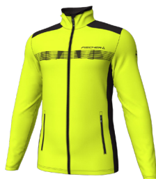
Q41F Evening Yellow