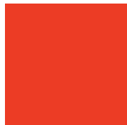
A65F TOMATO RED 17-1563 TPG