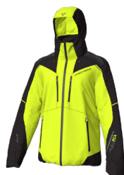
Q41F Evening Yellow