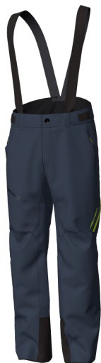
A28F Blue Nights