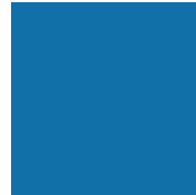
A34F BLUE ALERT 18-4252 TPG