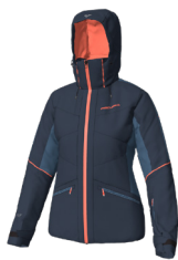
A28F Blue Nights