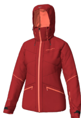
A67F Red Chili