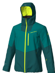
A57F Kayak Green