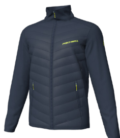
A28F Blue Nights