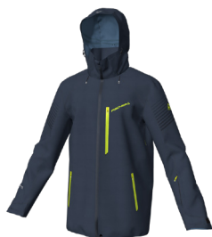
A28F Blue Nights