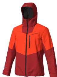
A65F Tomato Red