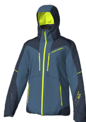
A26F Grey Sea