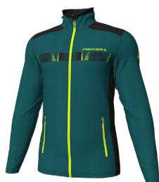
A59F Spruced Green