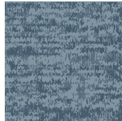
A27FM WINDWARD BLUE MELANGED 17-4018 TPG