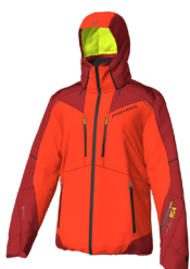
A65F Tomato Red