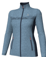
A27FM Windward Blue Melange