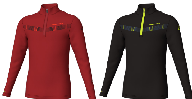
A67F Red Chili