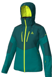
A57F Kayak Green