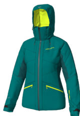
A57F Kayak Green