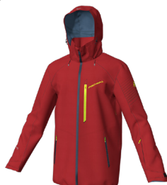
A67F Red Chili