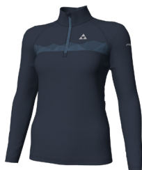
A28F Blue Nights