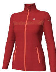
A67F Red Chili