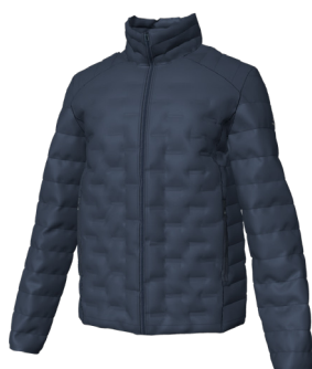
A28F Blue Nights