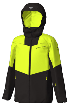
Q41F Evening Yellow