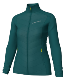
A59F Spruced Green