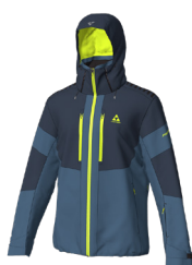
A26F Grey Sea