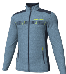
A27FM Windward Blue Melange