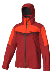
A67F Red Chili