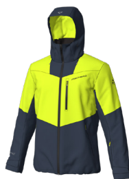
Q41F Evening Yellow