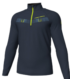
A28F Blue Nights