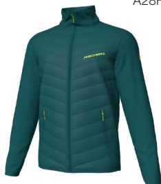
A59F Spruced Green