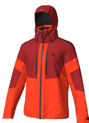
A65F Tomato Red