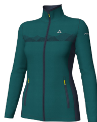
A59F Spruced Green