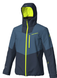
A26F Grey Sea