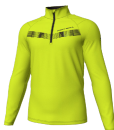
Q41F Evening Yellow