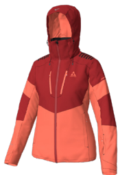
A62F Camellia Coral