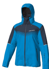
A34F Blue Alert