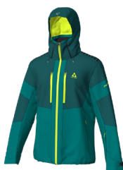
A57F Kayak Green