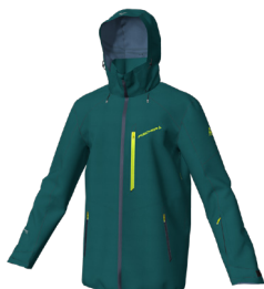
A59F Spruced Green