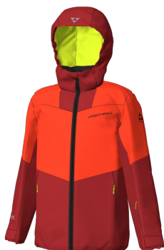
A65F Tomato Red