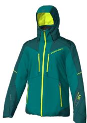
A57F Kayak Green