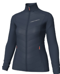
A28F Blue Nights