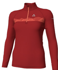
A67F Red Chili